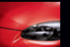
Velocity Red Mica

At Mazda, we take safe driving seriously. Which is why all of the photographs in this brochure were taken on a closed course with a professional driver.